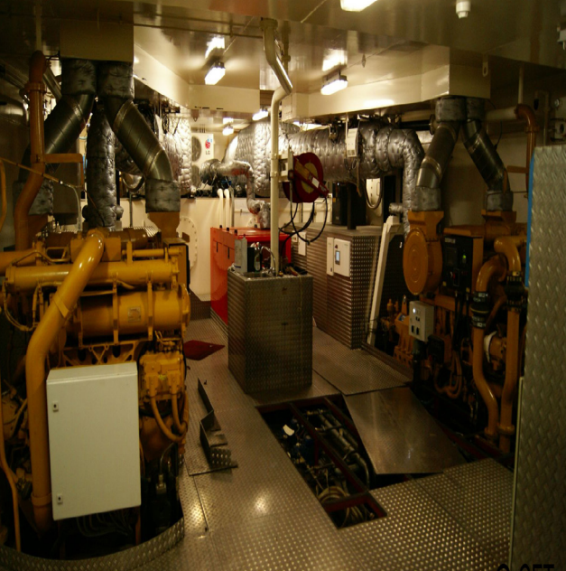
Motors combustion bed